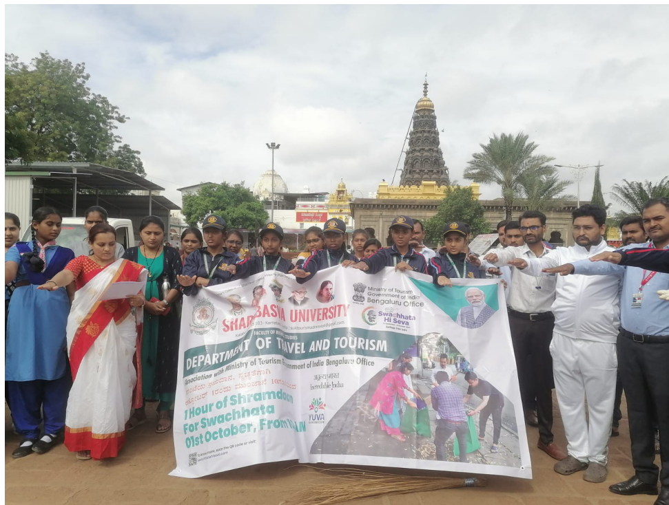
Group Photo Post Shramdaan for Swachhata and Swachhata Pledge