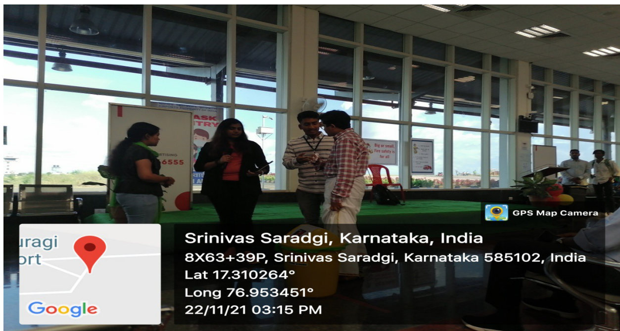
Skit Performance on swachh bharat abhiyan