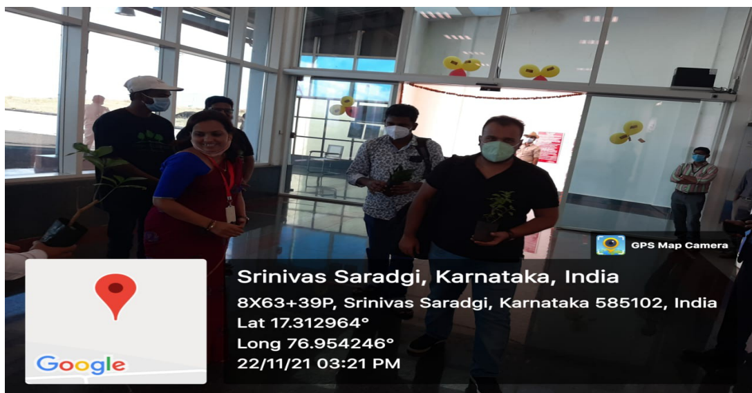
Sapplings Distribution to arrival passengers.