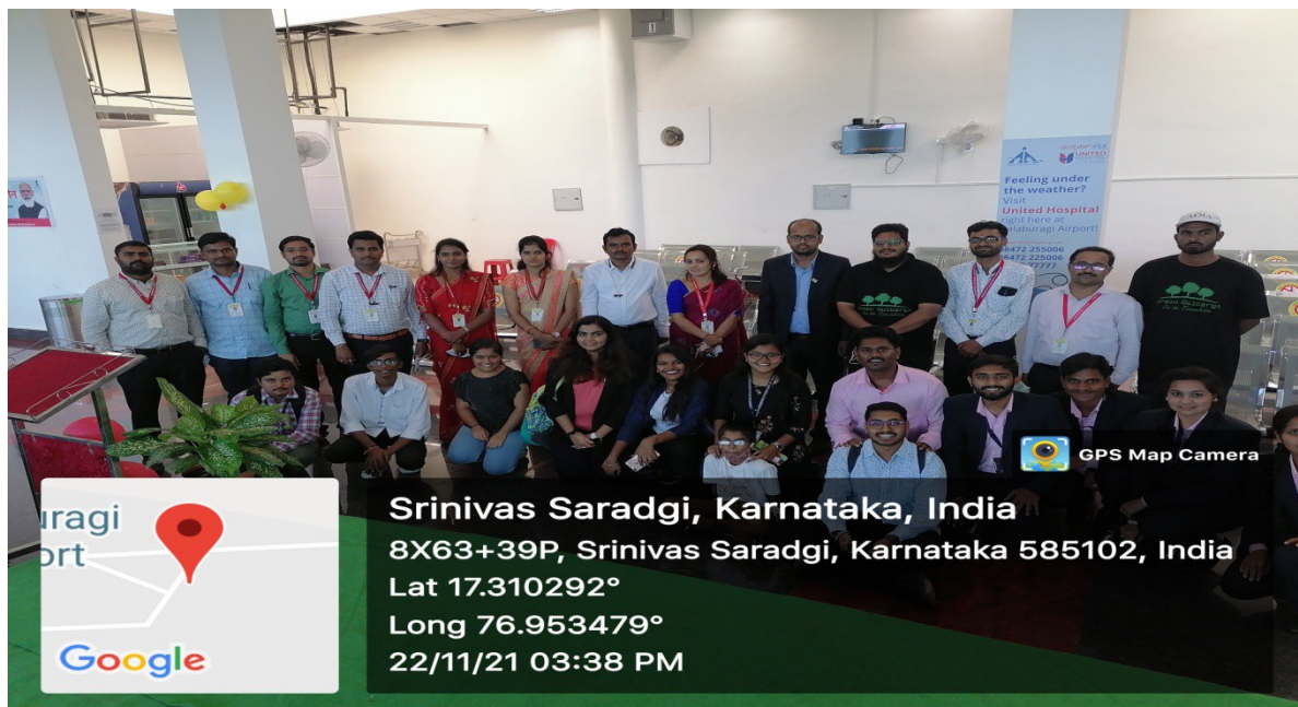
Group Photo at the Kalaburagi Airport Premises