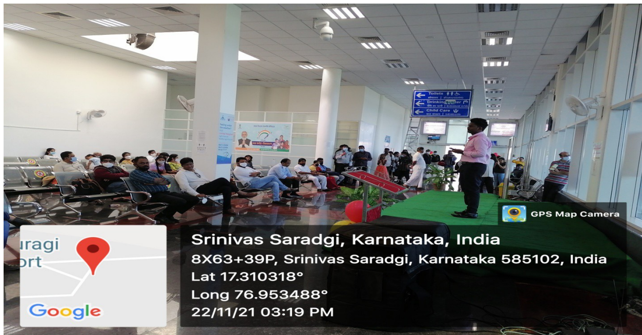
Patriotic Song Performance.