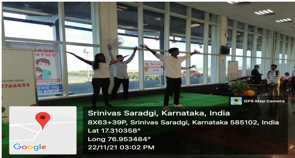
Dance Performance by students