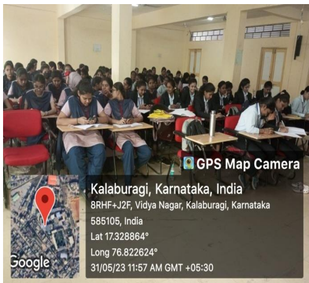
UG Students attending the webinar