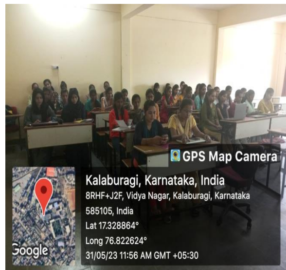
PG Students attending the webinar