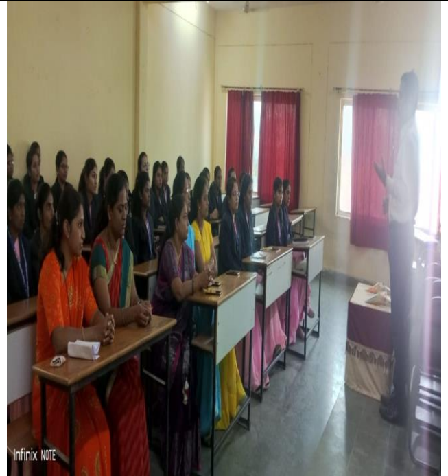
Talk by the Resource Person