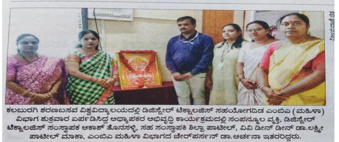
Inauguration of Five day's FDP