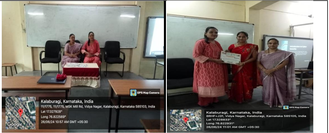
Day -5 Valedictory and certificate distribution to participant