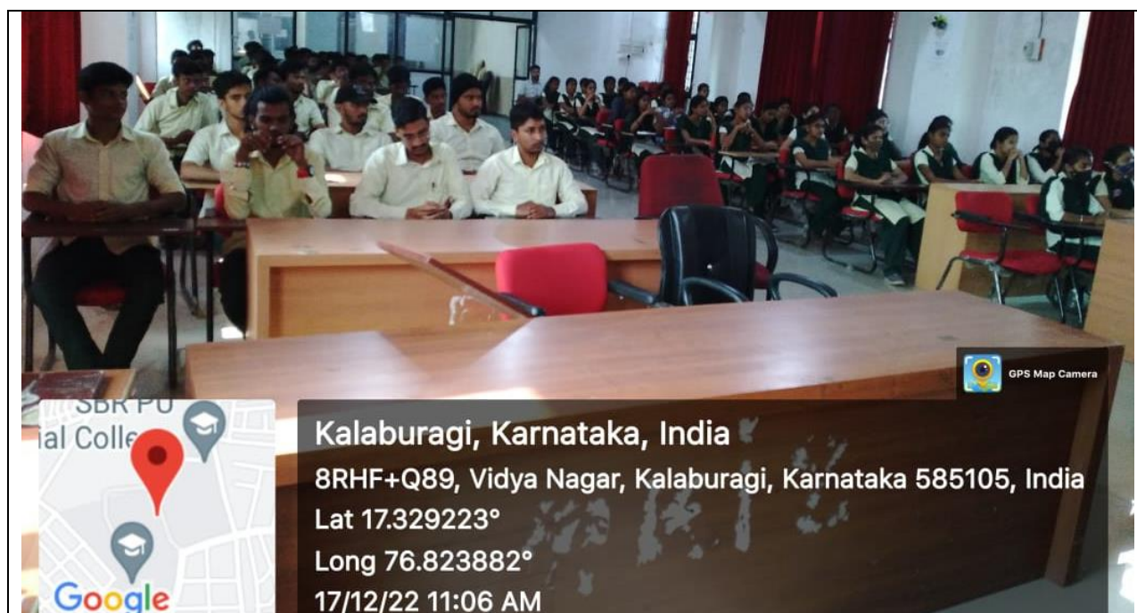
Figure-3-Participants attending the session