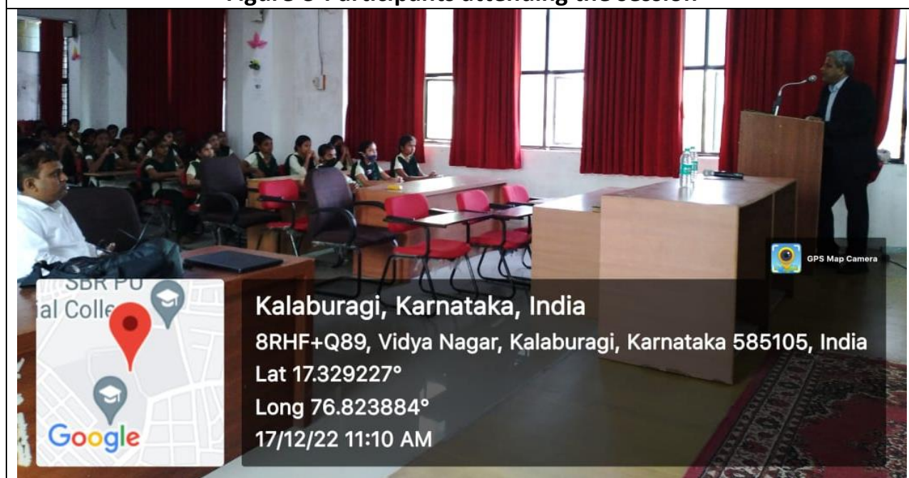
Figure-4- Participants attending the session and Speaker Delivering the talk