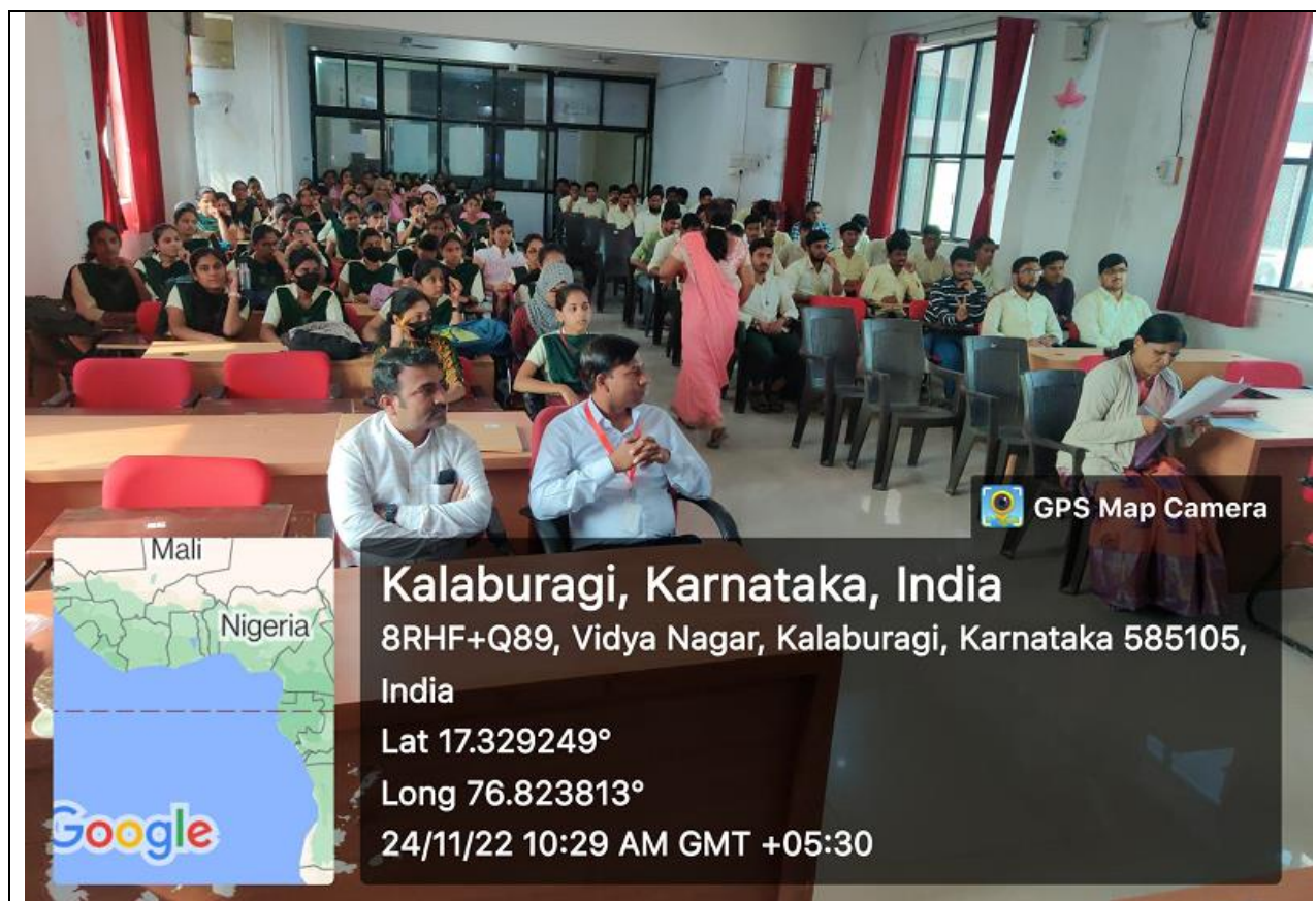
Figure-3-Participants attending the session