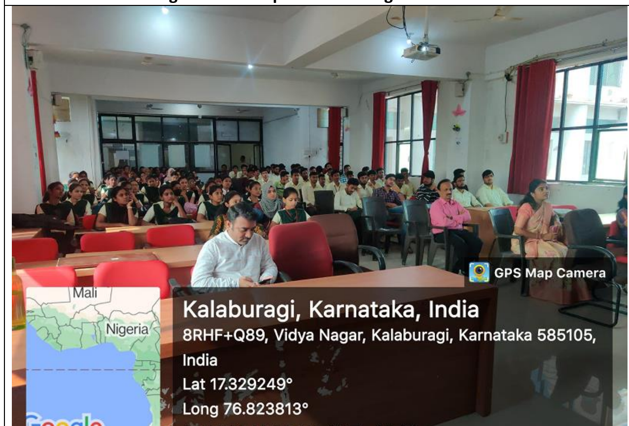
Figure-4-Participants attending the session