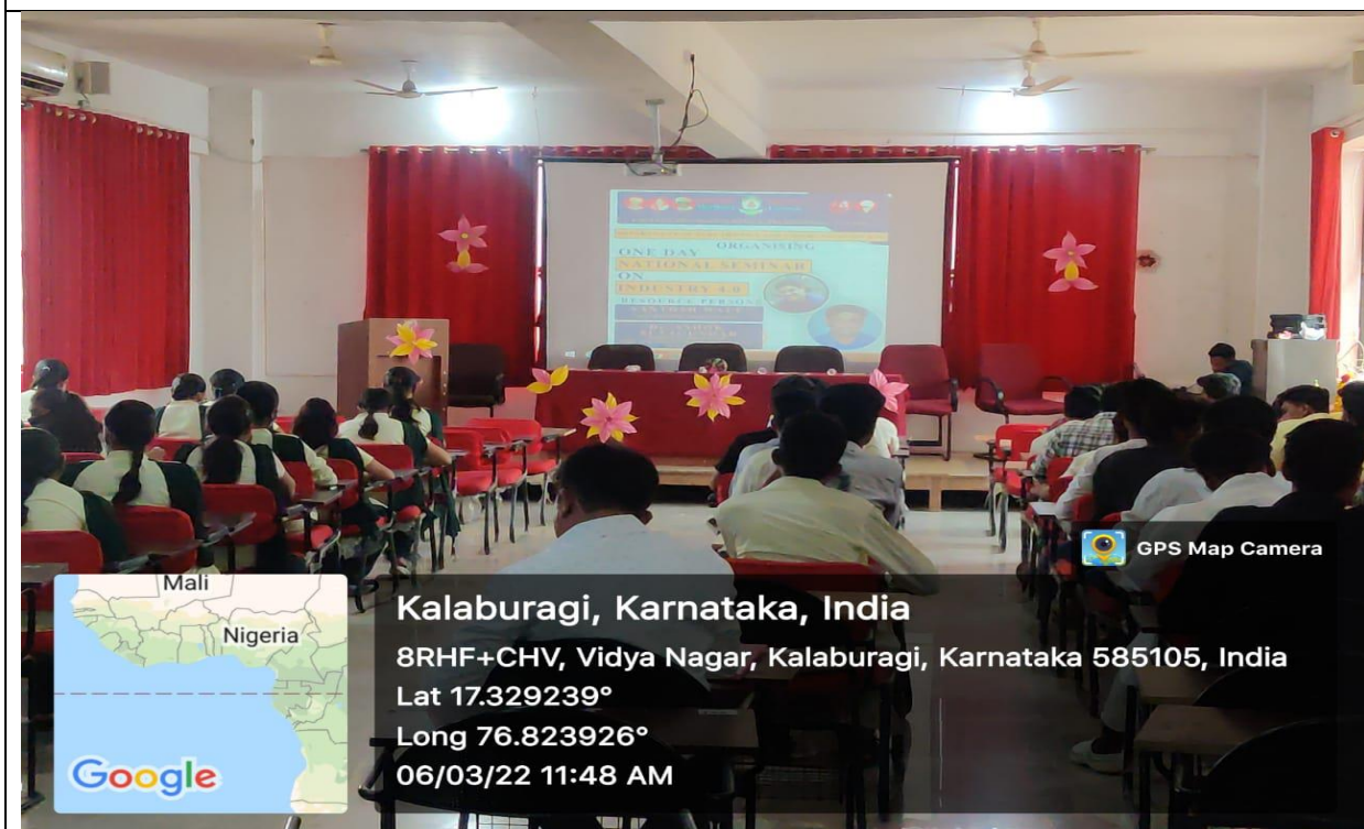
Figure1- Online session conducted by Mr. Santosh Wale