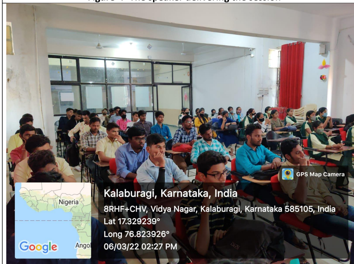
Figure.5. Students attending the session