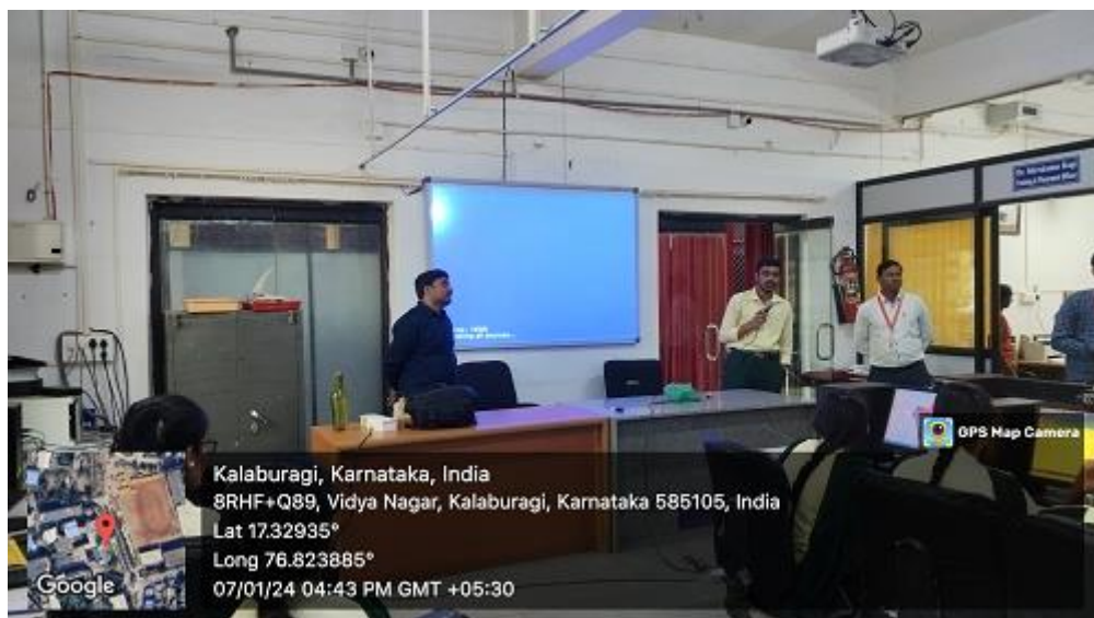
Figure 6: Feedback from the participants