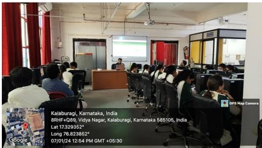
Figure 4: Session -3 conduction by Guest Speaker Mr.Praveenkumar E ,with Hands-On

Load Balancer,Auto scaling and Instance troubleshooting steps_EC2