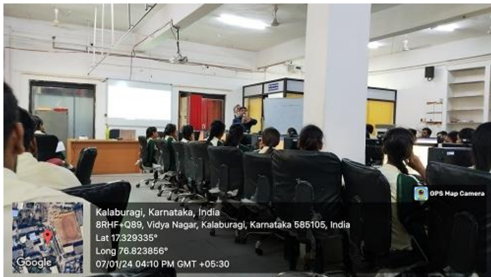
Figure:5 Session -4 conduction by Guest Speaker Mr.Praveenkumar E , with hand on Simple Storage Service (S3) , Identity and Access Management (IAM) and Real-world Use Cases.