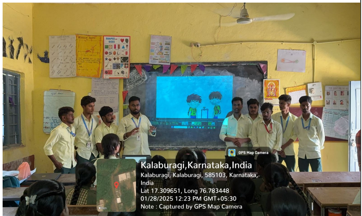
Figure-2-Rain water harvesting ppts,videos students conducting activity for VII std students at Sharan Sirasgi.