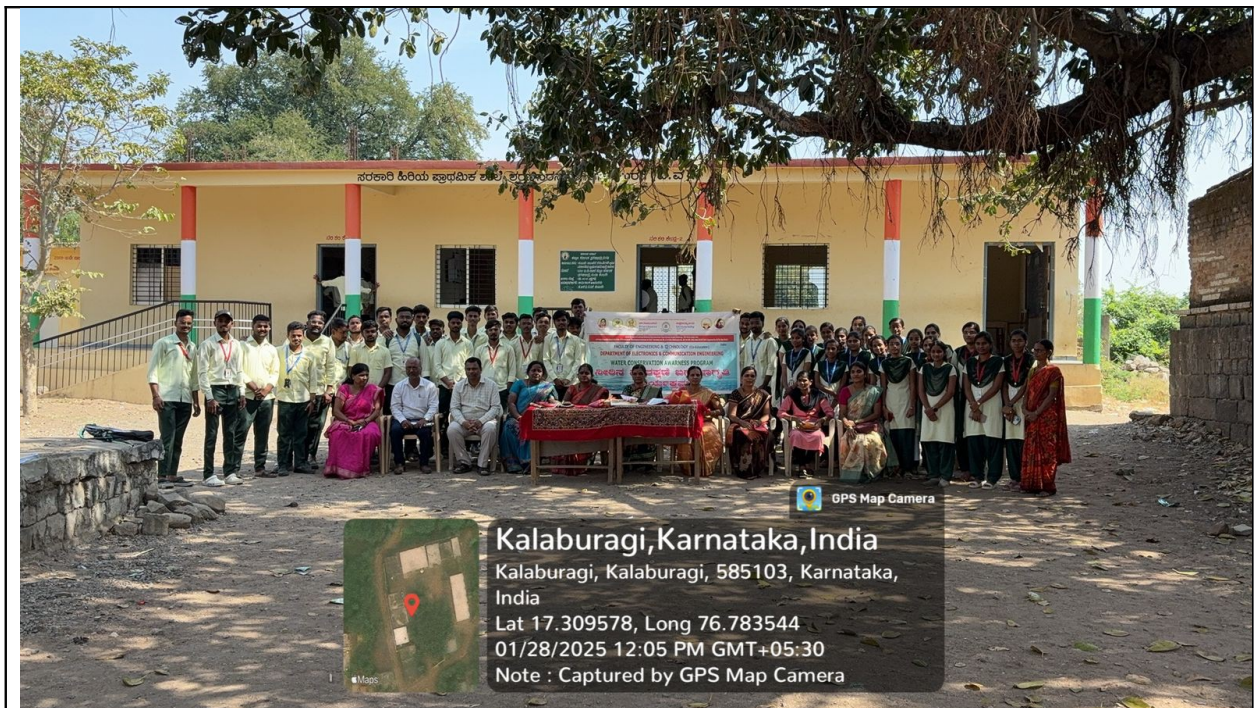
Figure1- Group photo of Faculty and students of Sharnbasva University, at Govt school Sharan Sirasgi Kalaburagi