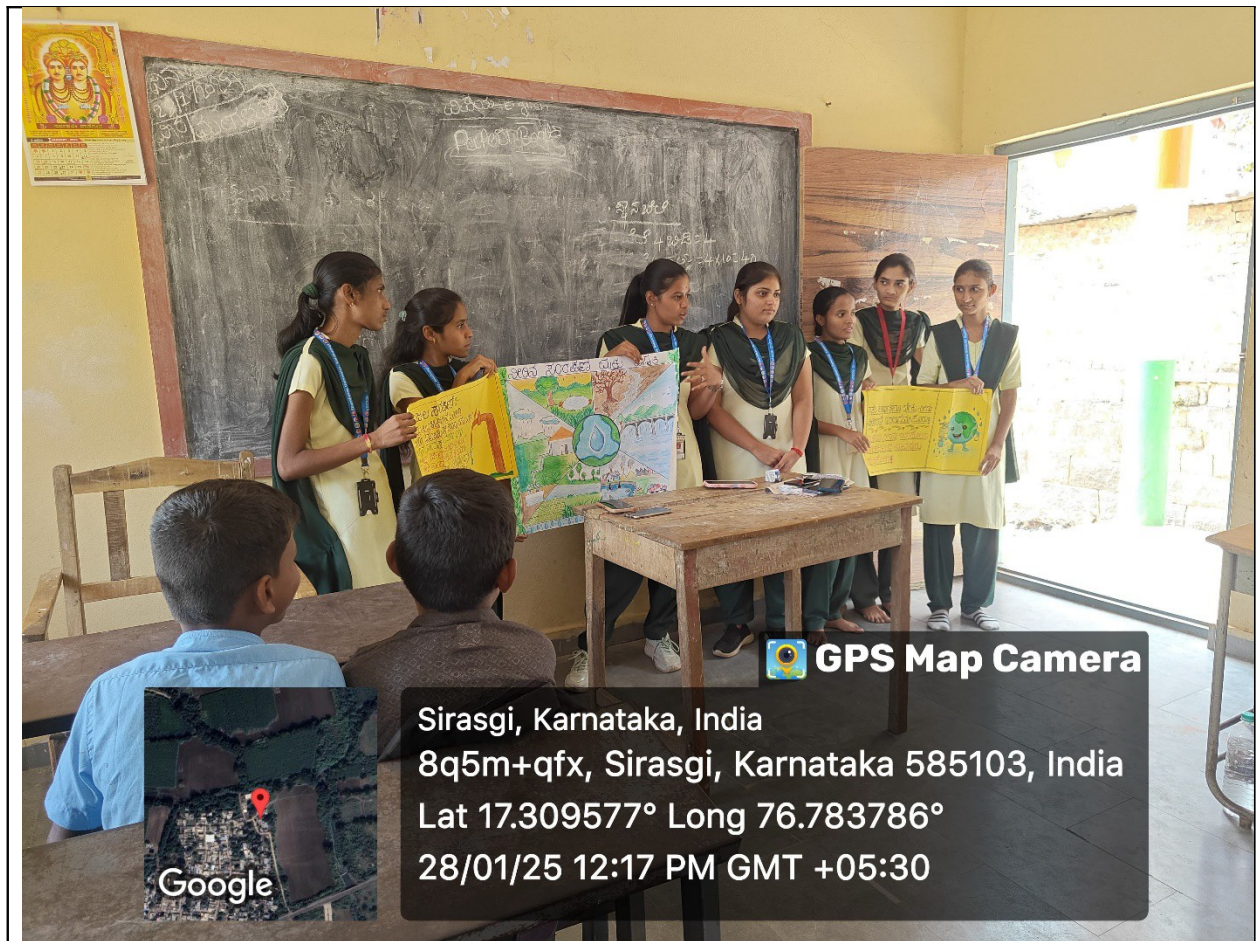
Figure-2-Rain water harvesting ppt, videos students conducting activity for VII std students at sharan sirasgi.