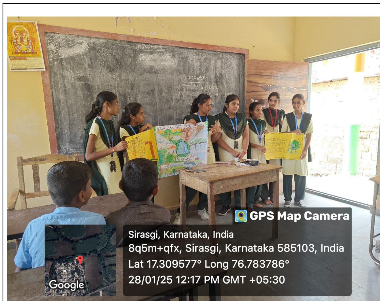
Figure-4-Chart preparation by students conducting activity for IV,V std students at Sharan Sirasgi.