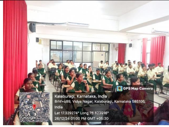
Faculties and students attending the Event