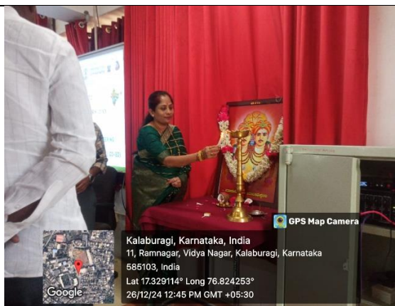
Inaugural of the by lightning of the lamp by delegates