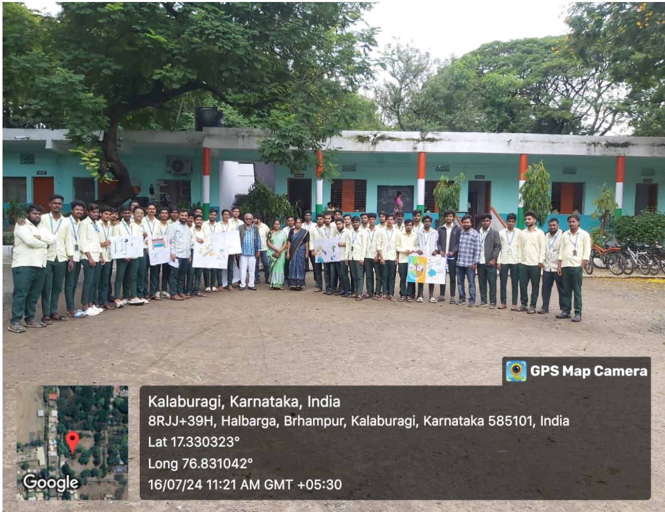
Mechanical Engineering 4 th Sem students of Sharnbasva University at the VTS high school with staff members