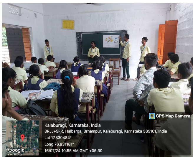
Students of 4 th sem Mechanical Engineering interacting about latest technologies and its importance with students