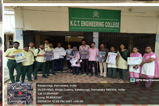
Figure 1: Invitations to all colleges by faculty members and students