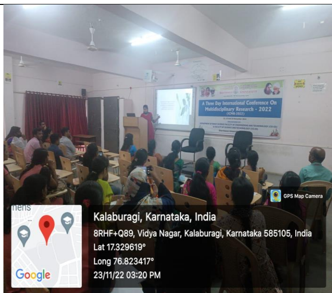
Figure-4-Session conduction by G.Meenu pragathi