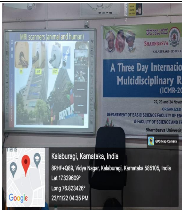
Figure-5-Session conduction by Dr.Jadesha Yaligar