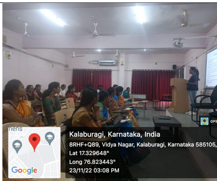
Figure-3-Session conduction by Dr.Balalakshmi