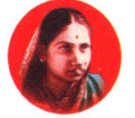
Lingaiya Pooja Matsuri Godda Anaji

ಕಲಬುರಗಿ ಜಿಲ್ಲಾ ಗಂಟ ಕರ್ನಾಟಕ - ಭಾರತ Kalaburagi-585 103, Karnataka - India