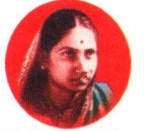
Lingakya Pooja Matsuri Goda Anaji

ಕಲಬುರಗಿ ಜಿಲ್ಲಾ ಗಂಟ ಕರ್ನಾಟಕ - ಭಾರತ Kalaburagi-585 103, Karnataka - India